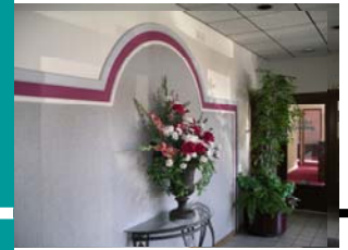
Silver Lake Professional Center

1710 * 1720 100th PL. SE, Everett, WA. 98208 (Silver Lake Highway 527)